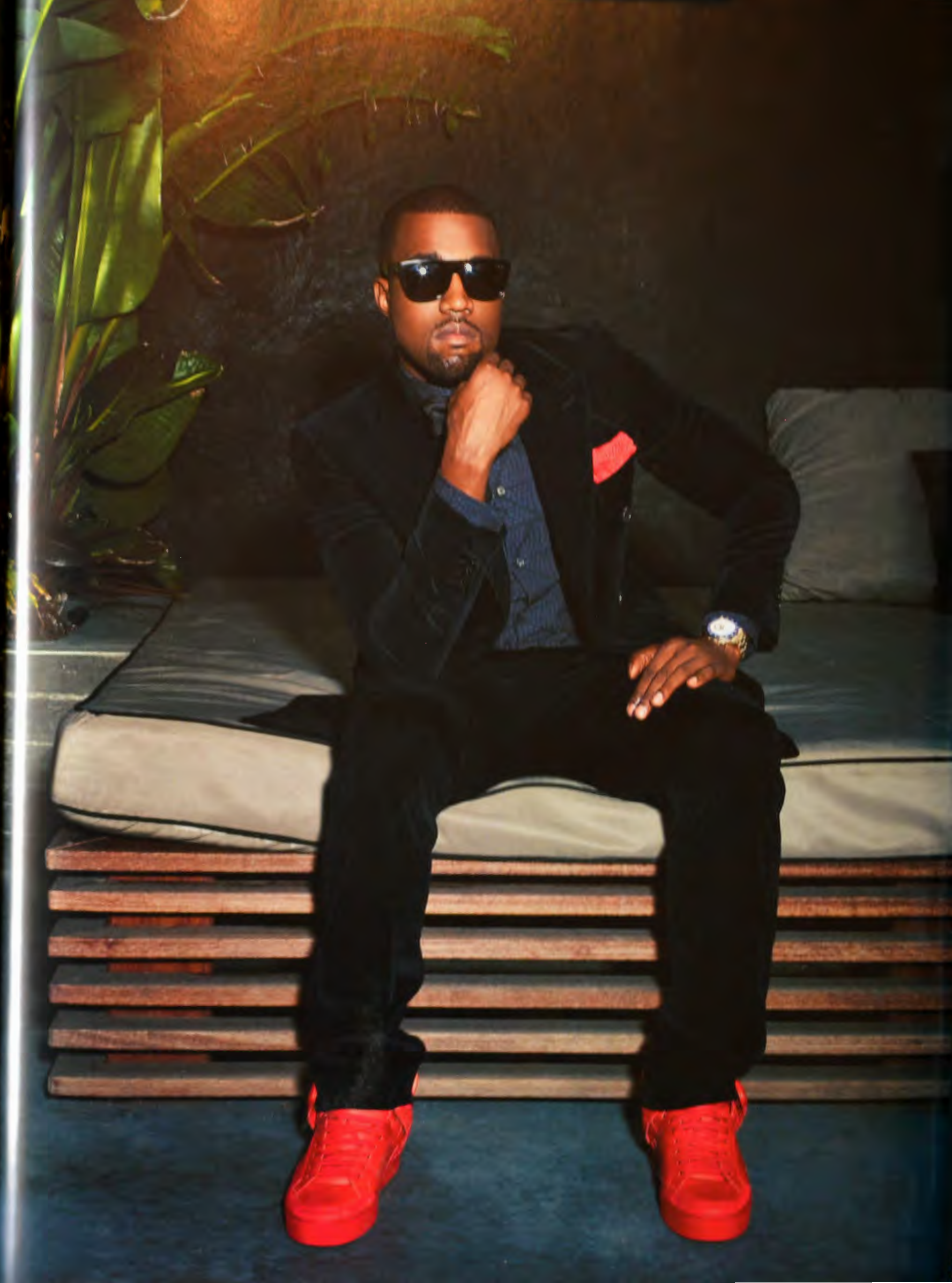
SUIT, SHIRT, BOW TIE AND SUNGLASSES: LOUIS VUITTON DON'S RED CALF LEATHER SNEAKERS: LOUIS VUITTON KANYE WEST COLLECTION WATCH: ROLEX