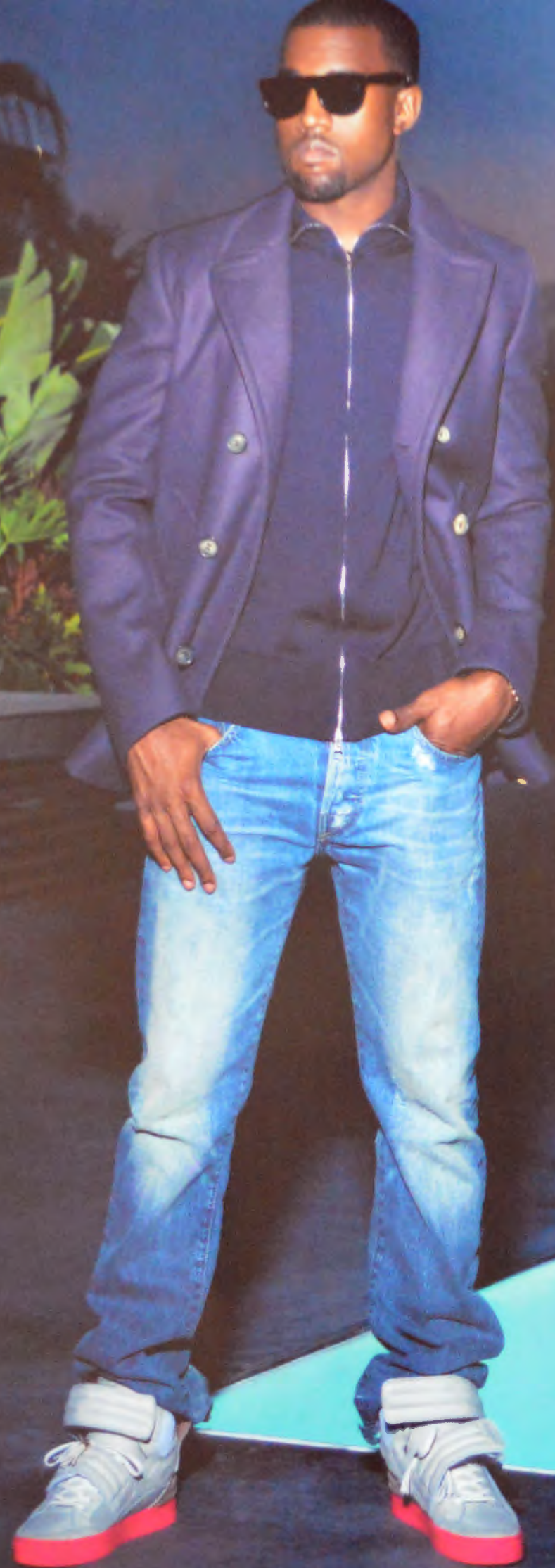
COAT, JACKET, TROUSERS AND SUNGLASSES: LOUIS VUITTON TOUR MIXED PATCHWORK SNEAKER BOOTS: LOUIS VUITTON KANYE WEST COLLECTION

Young Turk, and West is rubbing elbows with a fashion house that has often been seen as stodgy at best. The final results won't hit stores until this month, but there have been myriad photos leaked and plenty of speculation on the web - and it looks like this kooky partnership just might work.